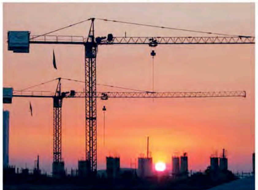
View of the Science Stadium under construction

The Wits Science Stadium is under construction on our West Campus. Built on the site of the former Charles Skeen Stadium, the structure retains the distinctive oval of the former athletics stadium, and makes use of the substructure of the former grand stand for five new large lecture theatres. This development also includes three laboratories for teaching first year biology, chemistry and physics, a new home for the Mathematical Sciences, and eventually a full Science, Engineering and Technology library.