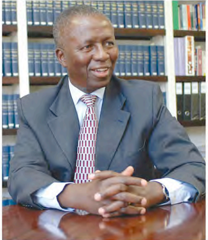
Wits Chancellor Mr Justice Dikgang Moseneke

The Chancellor also said he was delighted about the role the Chancellor's Annual Fund has played in raising support for these important infrastructural developments.